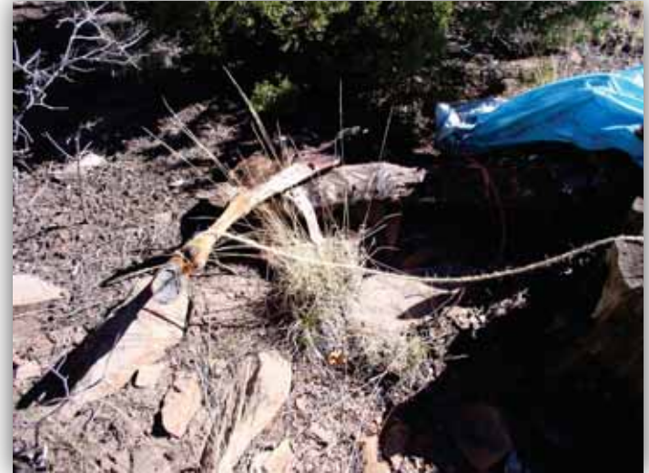
Elk carcass dumped