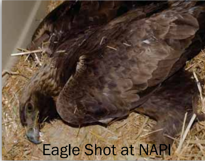
Eagle Shot at NAPI