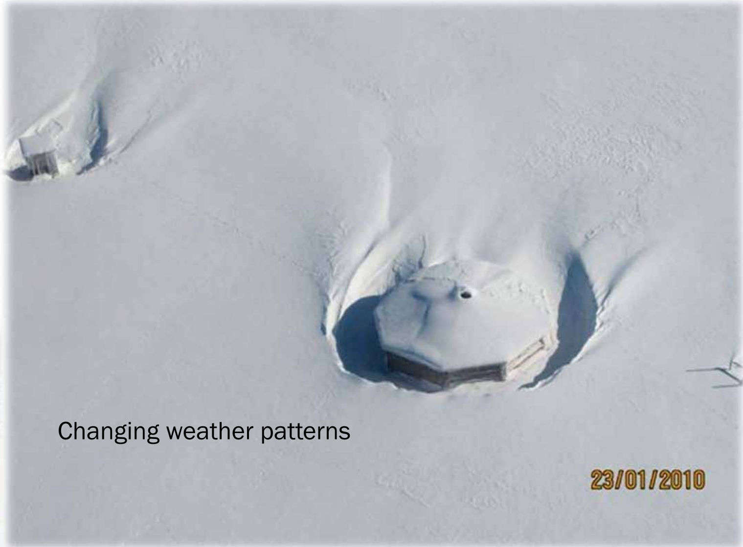
Changing weather patterns